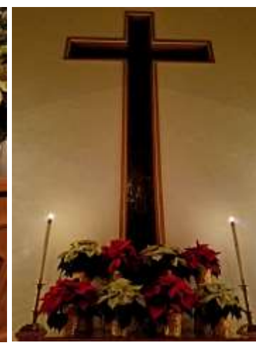
The church on Christmas Eve.