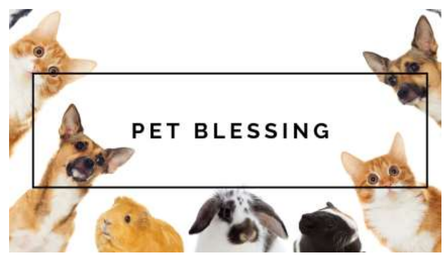
Sunday October 10 2021 at 11:00 a.m. East Lawn

Due to no hymnals in the pews due to covid-19, hymn selections need to be made by Sunday, August 29th.